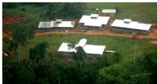
Arial view at RFIS. Google Earth coordinates: 3°48'5.55"N / 11°33'18.68"E

The Rain Forest International School is situated at the edge of Cameroon's capital Yaounde, a city with more than 2 million inhabitants.